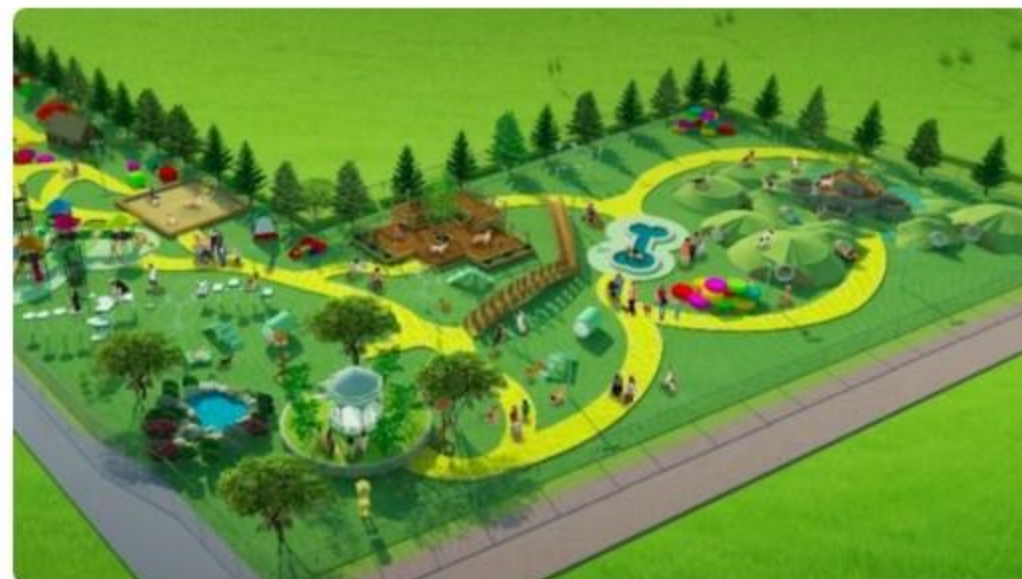
Pictured above: Emma's vision for the Dogs4Rescue site

Dogs4Rescue would like to open a dedicated sanctuary and rehabilitation retreat set in 40 acres of land, including woodland, streams, shelters and places to explore. The plan is to turn the area into the UK's largest kennel free dog sanctuary, helping many thousands of dogs in the future.