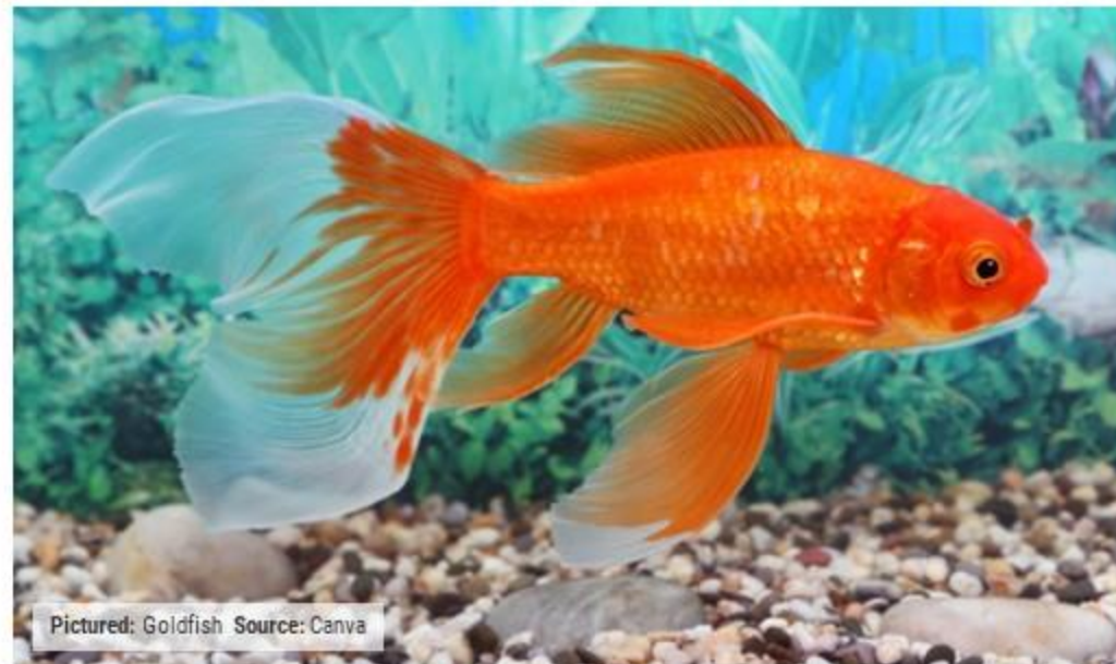
Pictured: Goldfish