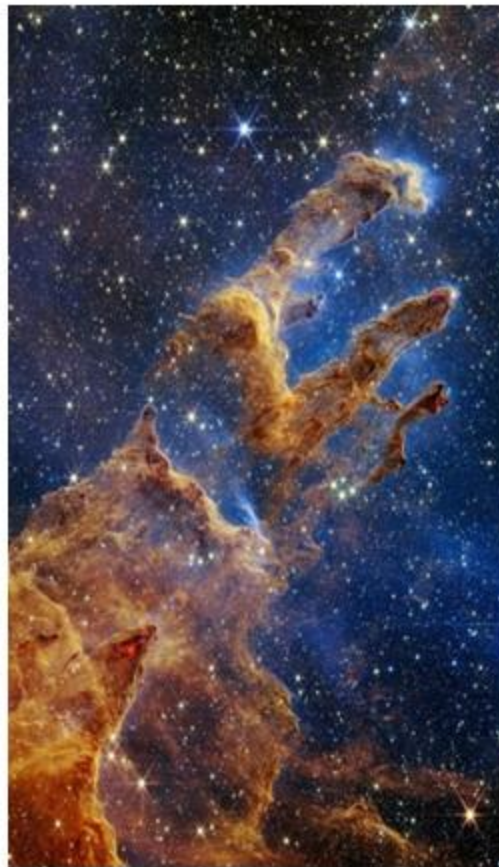
Pictured: The Webb telescope's breath-taking view of the Pillars of Creation.

Nasa's James Webb Space Telescope has taken a star-filled snap of the Pillars of Creation. This is the sharpest image ever captured of the iconic area of intense star formation, and was made possible by using the space telescope's near-infrared camera. The Pillars of Creation are in the Serpens constellation, in the Eagle Nebula, which is around 7,000 light-years from Earth. A light-year, a large unit of length used to express astronomical distances, is the distance a beam of light travels in one year. In interstellar space, light travels at approximately 300,000 kilometres per second, or 9.46 trillion kilometres per year. Nasa says, 'the ethereal scene captures translucent columns of cool interstellar gas and dust punctuated by piercing, bright points of light. Most of these are stars, and the reddish balls of fire near the edges of the pillars are newly formed stars.'