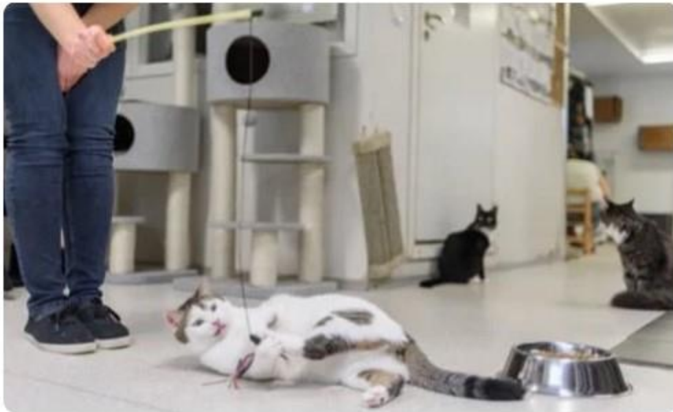
Pictured above: a volunteer playing with a cat in an animal shelter.

Not all animal shelters are the same but generally, they are an establishment that provides a temporary home for dogs, cats and/or other animals that are lost, unwanted or abandoned (this includes situations out of an owner's control). Their aim is to care for the animals until they can find suitable homes and are adopted. Animal shelters rely heavily on charitable donations.