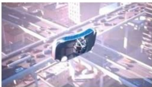
Pictured: Right - Alef's vision for its flying car, Left - the Model A flipped on its side in flight.