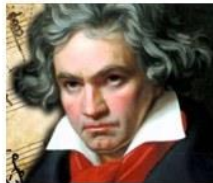
Ludwig Van Beethoven (pink) 651