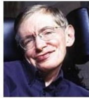
Stephen Hawking (yellow) 781

The new House Team Key Influencers were announced in assembly last week. The theme is people with a Special Educational Need or Disability. Our new House Team Key Influencers with this week's totals are: