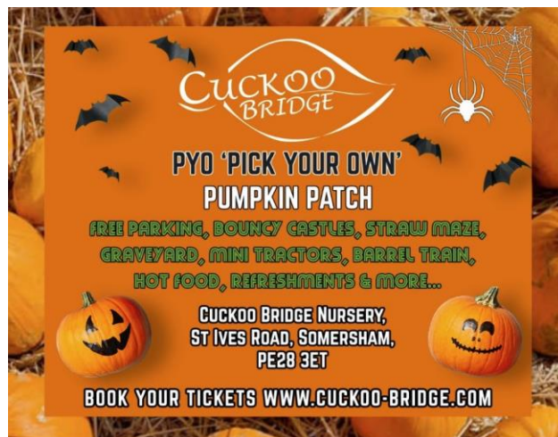
2 - Some pumpkin fun for the children (and grown-ups) to enjoy.