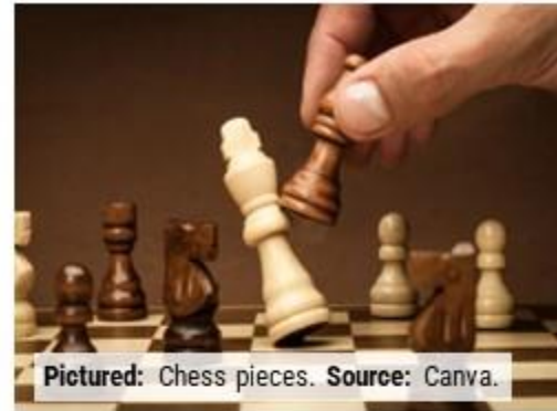
Pictured: Chess pieces.