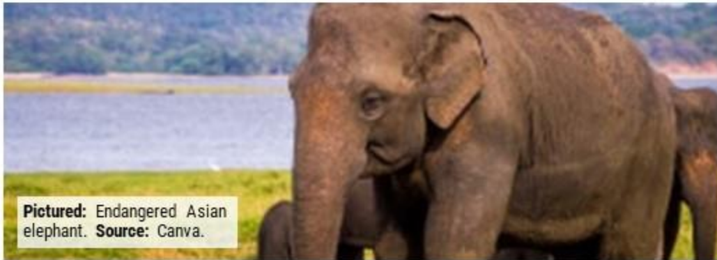
Pictured: Endangered Asian elephant.

meaning these animals are at a very high risk of extinction in the wild. Keepers at the zoo will collect the glittery poo twice a week and send it to a research laboratory at Chester Zoo for testing. The aim is to find out if any of the female elephants are pregnant. The elephants can then be suitably cared for in the hope of increasing their numbers.