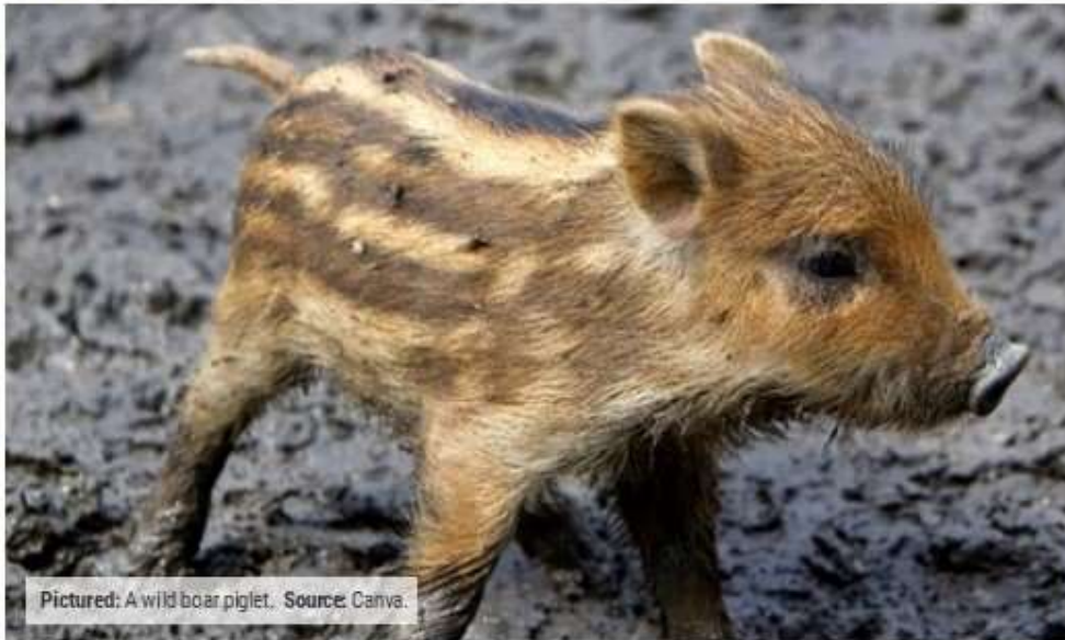
Pictured: A wild boar piglet.