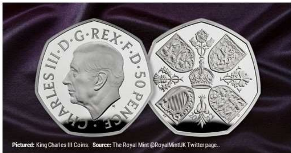
Pictured: King Charles III Coins.

the reason for this is unclear. Previous British kings were also shown on coins uncrowned, whereas Elizabeth's image appeared on British currency wearing a crown of laurels and a tiara or the royal diadem (an ornamental headband worn as a badge of royalty). The likeness of the King was created by British sculptor Martin Jennings, who said it was his smallest-ever work.