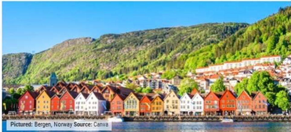
Pictured: Bergen, Norway

Bergen, a city on Norway's southwestern coast has announced that it will be opening Europe's longest cycle and pedestrian tunnel next month. The purpose-built, temperature controlled tunnel (constantly at 7 degrees Celsius) will link residential areas with the city. As the area is surrounded by mountains and fjords, it is hoped that the 2.9km tunnel will encourage people to leave their cars behind to use more environmentally friendly modes of transport. Project manager, Arild Tveit,