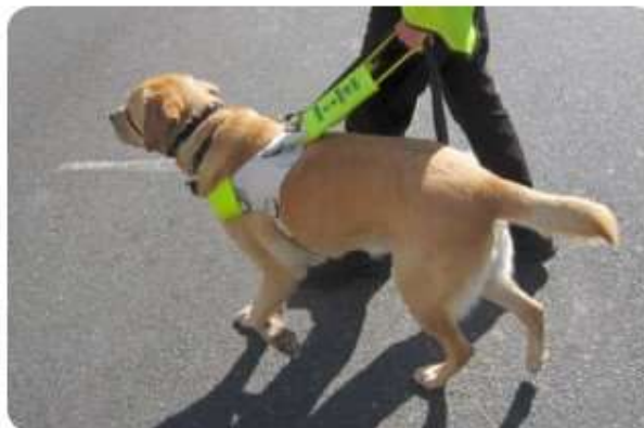
Pictured: a guide dog and owner, working together to cross a road.