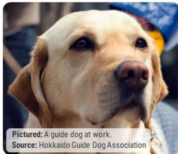
Pictured: A guide dog at work.

Living with a Guide Dog is always having your left-hand man close by. It's never having to ask one of the family to nip to the shop, it's taking your dog to work, it's knowing people are smiling at you when they watch us work. It's trusting him to keep me safe, it's heading out into a sighted world with nothing to fear and a spring in the step.