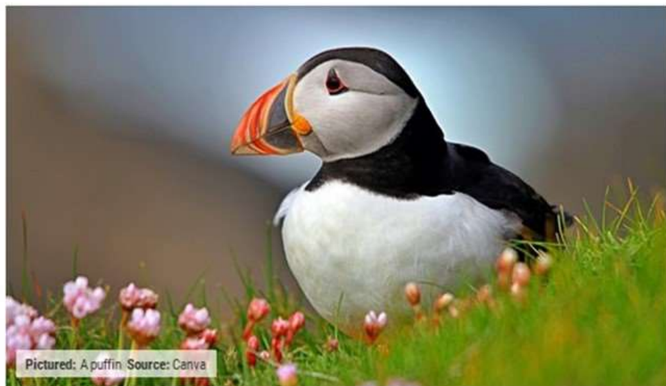
Pictured: A puffin.

National treasure, Sir David Attenborough, has released a new collection of programmes filmed solely in the UK, which celebrate its wildlife and wild areas. 'Wild Isles' is a set of five programmes, the result of a collaboration between the RSPB, WWF, and The Open University, working with the BBC and filmmakers, Silverback Films. This is the first time the renowned conservationist has made a series set entirely in Britain and Ireland. Sir David, who has worked at the BBC for over 70 years, said, 'In my long lifetime, I have travelled to almost every corner of our planet. I can assure you that in the British Isles, as well as astonishing scenery, there are extraordinary animal dramas and