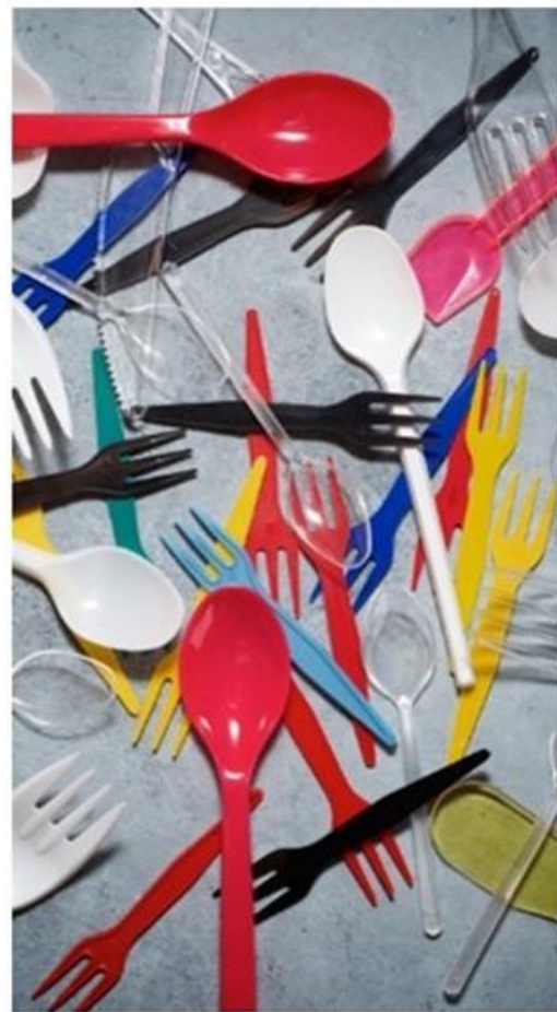
Pictured: Disposable plastic cutlery

The government has announced that single-use plastic plates, trays, bowls, cutlery, balloon sticks and certain kinds of polystyrene cups and food containers will be banned in England for environmental reasons. This follows similar announcements already made by Scotland and Wales. Research by Defra (Department for Environment, Food and Rural Affairs), tells us that each person in England uses an average of 18 single-use plastic plates and 37 items of plastic cutlery every year. Also stating that only 10% of those are recycled. 1.1 billion single-use plates and more than 4 billion pieces of plastic cutlery are used in England annually. This new rule applies to plastic packaging for food and drinks from restaurants and cafes, not supermarkets and shops (which the government will consider separately). Environment Secretary Thérèse Coffey, said, 'This new ban will have a huge impact to stop the pollution of billions of pieces of plastics and help to protect the natural environment for future generations.' Other