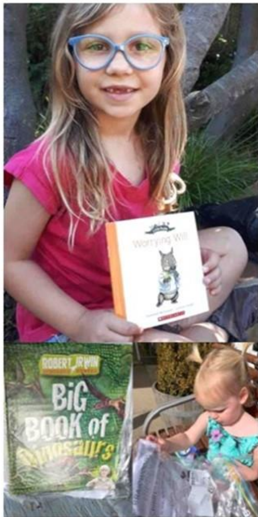
Pictured: Children enjoying the literary treasure hunt in Braidwood.

A literary treasure hunt is where children search for and find hidden books, read them and re-hide them for others. One such book hunt is based in Braidwood, a small town in the Southern Tablelands of New South Wales, Australia. A variety of books suitable for all ages of children are hidden all around the town, in locations such as shop windows, among shrubs, in parks, on benches and anywhere the children involved think would be a good hiding place for them. Each book is placed inside a plastic bag to keep it safe with a flyer that says: 'You are the lucky finder of this book. Read it, enjoy it, and then re-hide it for someone else to enjoy. Please reuse this bag. Add your name inside the cover and let's see how many can find it!' It has been reported that the people of Braidwood are enjoying the treasure hunt, after hearing about similar ones in other towns and setting up their own. 'It's lovely to watch the little kids' faces when they find the books, and it's just a little bit more magical,' mum of 5, Samantha Dixon said, adding 'I enjoy the fact these books are being read and are not just being left on the shelves and that kids are outside finding them not on screens.' Do you think this is a good idea for a treasure hunt? Can you think of anything else that could be hidden for a treasure hunt?