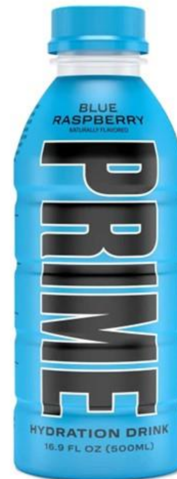
Pictured above: Prime Hydration Blue Raspberry flavour.

Prime Hydration comes in many flavours, including Blue Raspberry, Lemon and Lime and Ice Pop.