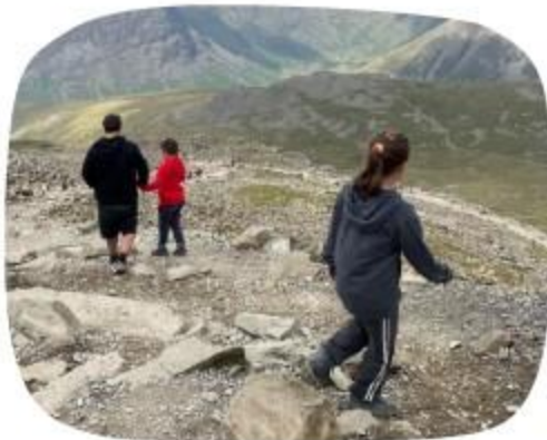
Descending Scafell Pike, England's highest mountain.

The experiences we have such as holidays, activities or challenges we overcome.