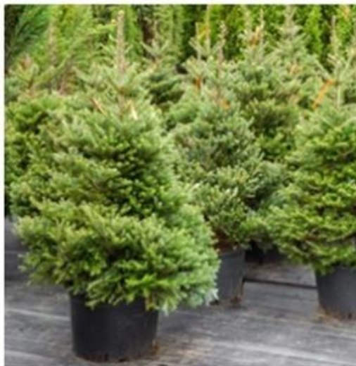
Pictured: Christmas trees in pots