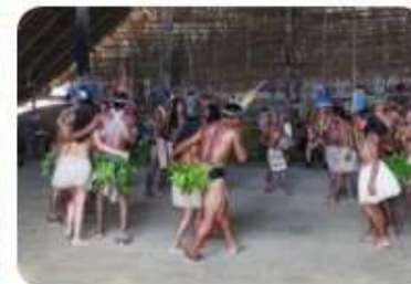
Pictured above: Images of indigenous peoples living in the Amazon rainforest.

How does life in the Amazon rainforest compare with yours?