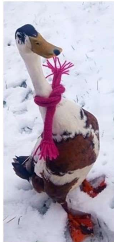
Pictured: Ham the duck