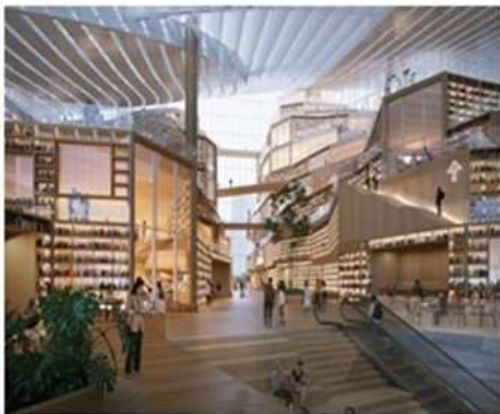
Pictured: Wuhan Library design images