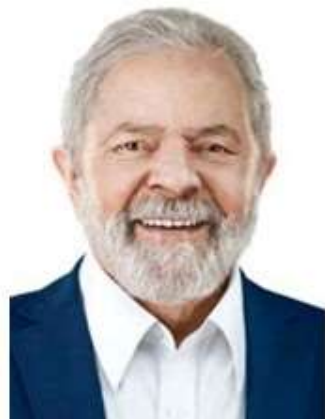
Above: President Lula of Brazil.

Lula said he is committed to helping the Amazon. In his victory speech, he said, 'Let's fight for zero deforestation. The planet needs the Amazon alive. A standing tree is worth more than tons of wood illegally harvested by those who think only of easy profit.'