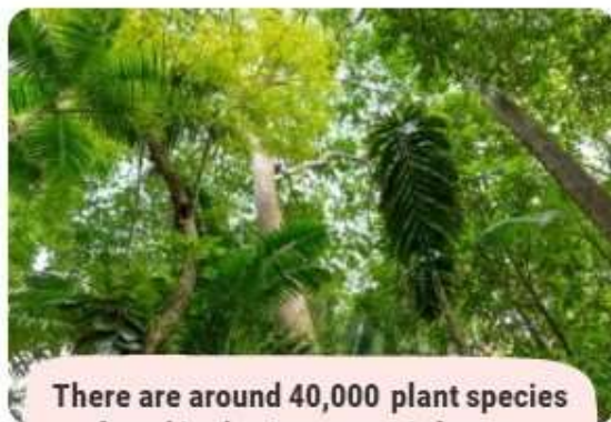
There are around 40,000 plant species found in the Amazon rainforest.

People live in the Amazon rainforest. Some have settled more recently; others are part of indigenous groups, who have been living there for thousands of years.