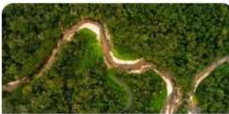
Aerial view of part of the Amazon rainforest.

Some groups live by the Amazon River. They hunt for fish and birds and harvest wild rice and crops (beans, pepper, coca, bananas).