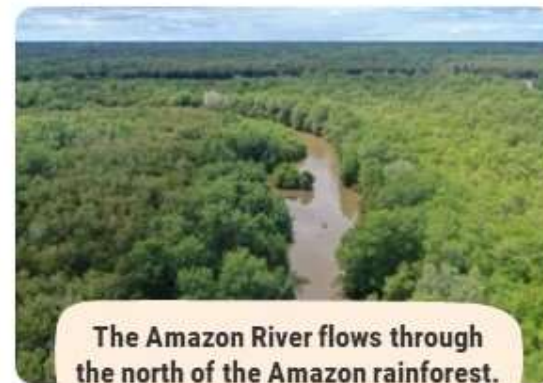
The Amazon River flows through the north of the Amazon rainforest.