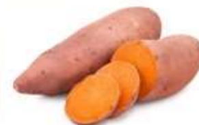
Pictured: Sweet potato

It is believed there are groups of people living in the Amazon rainforest, who have never had contact with the outside world. It is thought they live in harmony with the forest, using its resources for food and shelter.