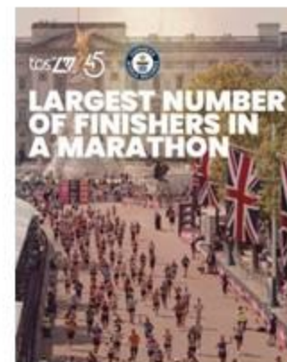
Pictured: The TCS London Marathon has broken the Guinness World Records title.