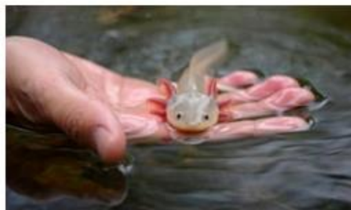
Pictured: An axolotl.

Do you know any facts about axolotls? How would you feel if you saw an axolotl in real life?