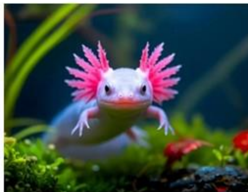
Pictured: An axolotl.

A group of endangered axolotls has been released into special wetlands near Mexico City, and they're doing well! Scientists released 18 of the smiling amphibians, which were bred in captivity, into clean water habitats. Each one had a tiny radio tracker to help researchers follow them. All the axolotls survived, and many gained weight, meaning they were hunting and eating. Dr. Alejandra Ramos, from the Autonomous University of Baja California, called it an amazing result. Axolotls were once common in Mexico's lakes, but pollution and city growth pushed them close to extinction.