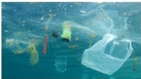
Pictured: Plastic in the sea.

plastic. Sea turtles love to eat jellyfish and seaweed, but sometimes they accidentally eat plastic bags floating in the sea, because the bags look just like jellyfish! This can make turtles very unwell, and some sadly die from eating plastic. There are some things we can all do to help, such as keeping beaches clean, recycling correctly, never dropping litter, learning more about turtles and telling friends and family how to help too! Let's all do our part to protect turtles and keep the sea a safe place for them to live! Did you know a plastic bag can stay in the sea for hundreds of years?