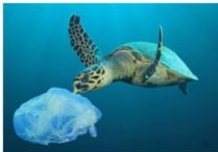
Pictured: A sea turtle eating plastic.

Last Friday, it was Endangered Species Day, a day to learn about animals that need our help. These animals are called endangered species, which means there aren't many of them left, and they could disappear if we don't do something to help. Some endangered animals include tigers, rhinos, pandas, elephants – and turtles! This Friday is World Turtle Day, a special day to celebrate turtles and find out how we can help them. Turtles are clever, gentle animals. Some live in the sea, and some live on land. They have been on Earth since the time of the dinosaurs! But today, many turtles are in danger and one big problem is