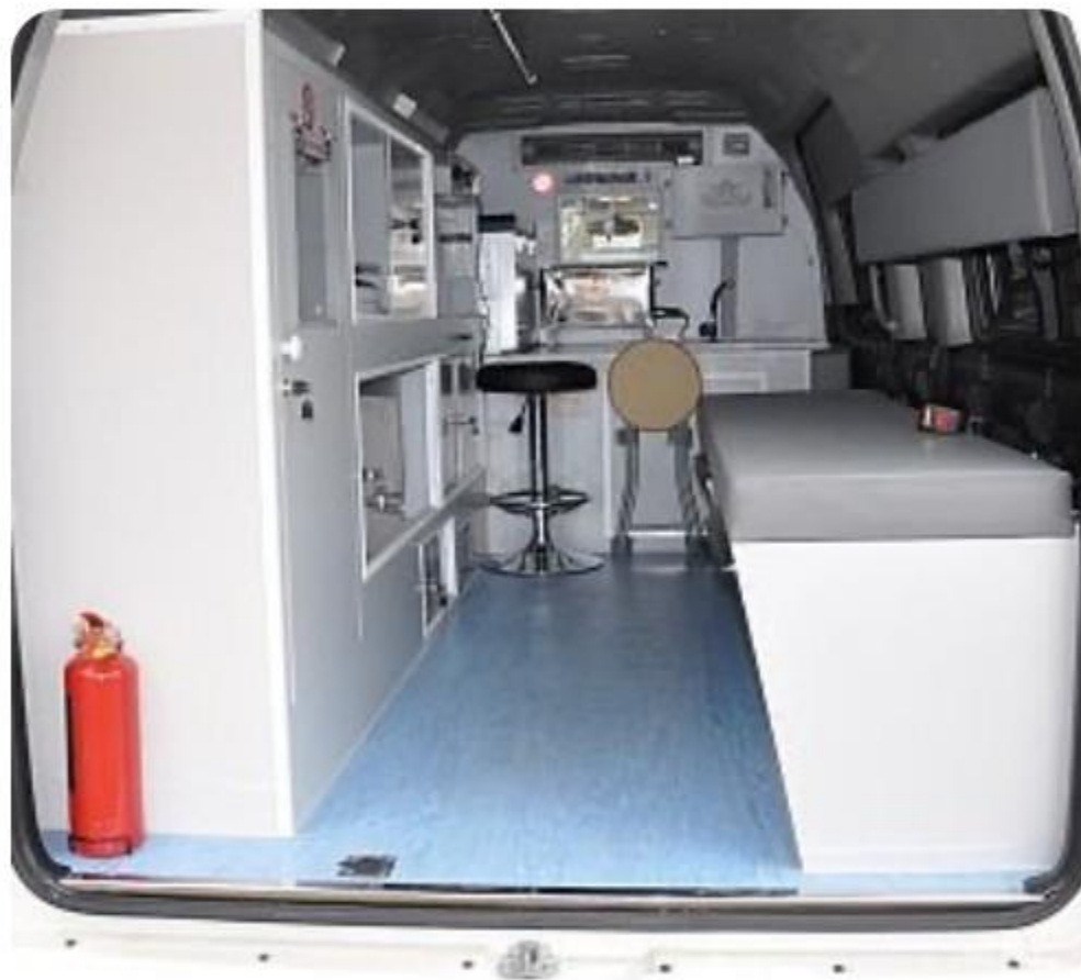
Pictured above: What the refitted popemobile could look like inside, based on another mobile health unit.