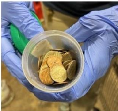
Pictured: Thibodaux, the 36-year-old leucistic American alligator (below) and the coins removed from Thibodaux's stomach (above).

How do you think staff at the zoo could stop the coins from ending up in the animals' water?