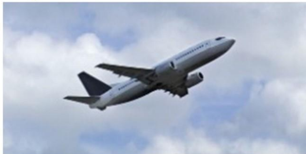
Pictured: A flying plane.

Unusually high winds in the Atlantic jet stream have pushed passenger planes to supersonic speeds! Experts say the near record-breaking wind speeds are due to very cold temperatures in the northeast USA and much warmer air in the south. One commercial flight, travelling from Washington to London, was pushed to nearly 800mph. Another flight from New Jersey's Newark Airport to Lisbon, in Portugal, reached speeds of 835mph. This is much faster than a passenger aeroplane's typical flying speed, which would normally be around 575mph. 'This evening's weather balloon launch detected the 2 nd strongest upper-level wind recorded in local history going back to the mid-20 th