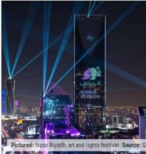
Pictured: Noor Riyadh, art and lights festival.