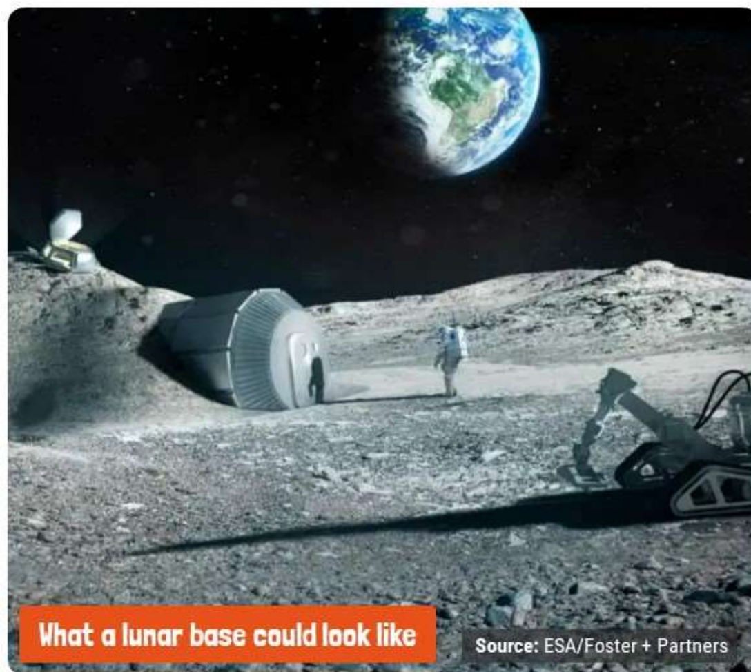
What a lunar base could look like