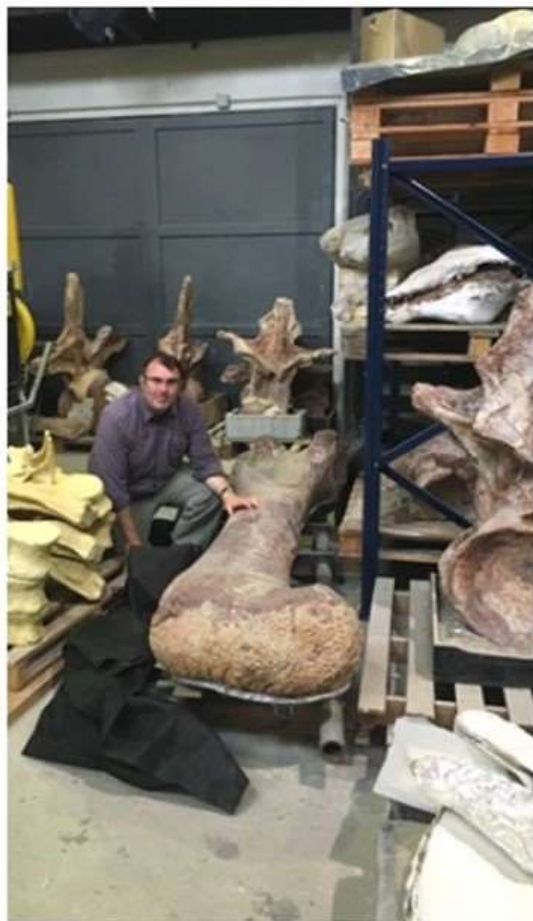
Pictured: Professor Paul Barrett showing the scale of Patagotitan

The Natural History Museum, in London, is getting a new dinosaur to display and it's the biggest so far! The colossal titanosaur Patagotitan mayorum, the largest known creature to have ever walked our planet, is going on display for the first time ever in Europe. The cast of Patagotitan mayorum is being loaned to the museum by the Museo Paleontologico Egidio Feruglio in Argentina, which excavated the giant skeleton in 2014. The giant prehistoric creature is much bigger than the museum's other exhibits, weighing 57 tonnes (four times heavier than Dippy the Diplodocus) and measuring 37 metres (12m longer than Hope the blue whale). Professor Paul Barrett, science lead for the exhibition, said, 'Patagotitan mayorum is an incredible specimen that tells us more about giant titanosaurs than ever before. Comparable in weight to more than nine African elephants, this star specimen will inspire visitors to care for some of the planet's largest and most vulnerable creatures, which face similar challenges for survival, and show that within Earth's ecosystems, size really does matter.'