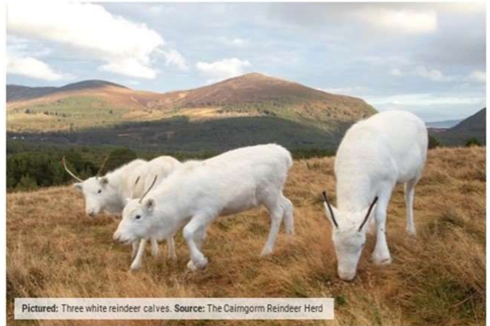
Pictured: Three white reindeer calves.