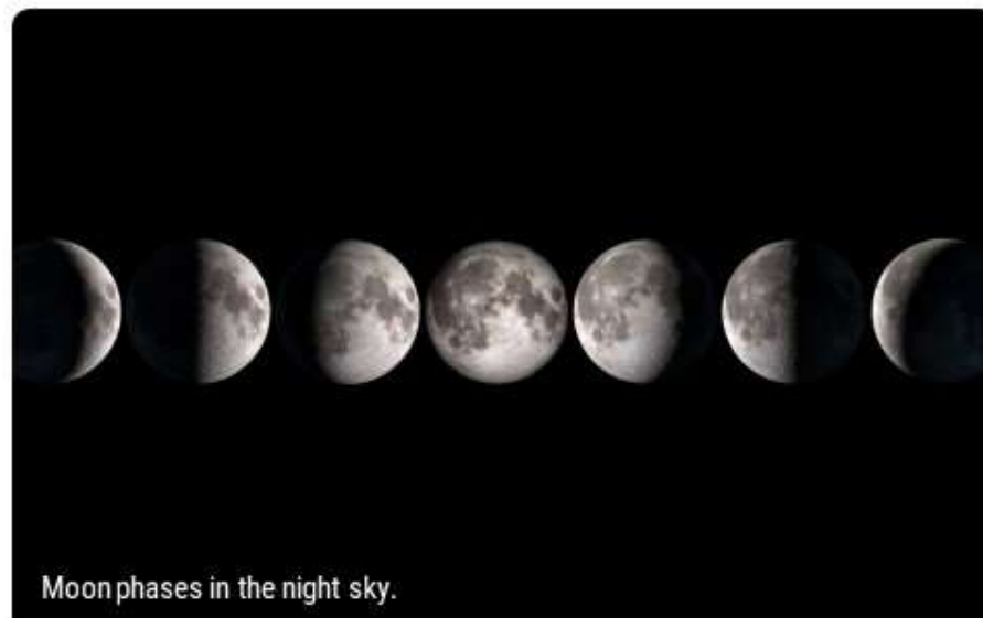
Moon phases in the night sky.

The Moon is not a source of light. It reflects light from the Sun, which is why we can see it. It takes 27 days to orbit the Earth. Its orbit around Earth is shaped like a slightly squashed circle, known as an ellipse. As the Moon orbits, some of the light from the Sun is blocked by the Earth making it appear to change shape as we see more or less of it. These shapes are called the phases of the Moon.